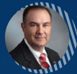
Honorary Chair Lt. Governor, MO, Mike Kehoe

Jane Smiley delivered the keynote address for the 2020 MOmentum gala. Her remarks were open to the public, and Missouri college students in humanities departments were specifically invited to listen and learn from the Pulitzer Prize-winning author. In addition to her life as a novelist, Smiley is an essayist and contributing writer to The New York Times.