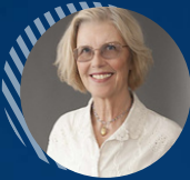
Keynote Speaker Pulitzer Prize-Winning Author, Jane Smiley

On October 17, 2020, Missouri Humanities hosted our fifth annual gala. Nearly 300 guests registered to attend this year's event moved from the Missouri Botanical Gardens in St. Louis to a virtual format.